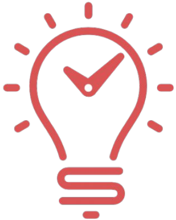
Weekly project usage